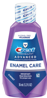
Crest® PRO-HEALTH™ Advanced Enamel Care Mouthwash Two cases of 48, 36mL bottles