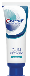
Crest® PRO-HEALTH™ Gum Detoxify™ Toothpaste One case of 24, 4.1oz tubes